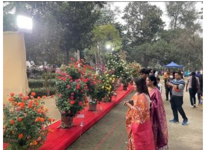
Left: Pune Rose Show, Right: Kolkata Rose Show

Next was Bhopal, hosting their three-day 42 nd All India Winter Rose Show of the M.P. Rose Society at Bhopal from 6 th to 8 th January, 2023. There were about 6000 flowers displayed on the show table in various sections. A total of 70 rose gardens maintained by Government/Institutions and Private individuals participated in the competition. Bhopal has a very conducive climate for growing quality roses. The M.P. Rose Society has plans to develop a few more large Rose Gardens in and around Bhopal in the near future.