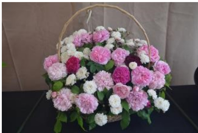
Left: Miniflora English Boxes, Right: Old Fashion Rose Basket