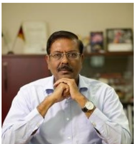
“Roses in Bhutan” , Prakash Sushil, India

Sangerhausen') has only just been published.