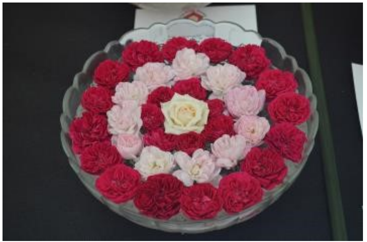
Left: Hybrid Tea Bouquet, Right: Roses in a Bowl