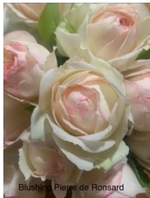
Blushing Pierre de Ronsard