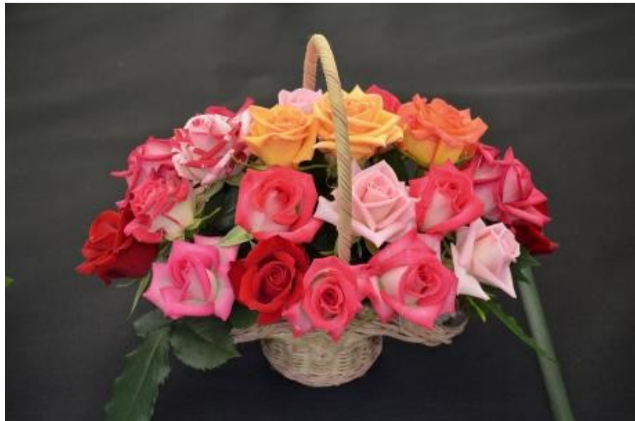
Above: Rose Society UK Summer Show held at Shepperton, London in June 2022