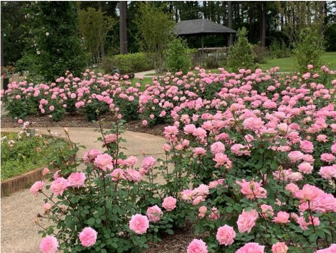
Above: Bed of 'McFarland' a 2019 Hybrid Tea by Meiland, Below: ARS Convention Logo