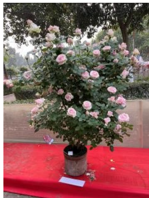
Left: Winning exhibits at the Jabalpur Rose Show, Right: a rose in a pot entry, Kolkata Rose Show

Malwa Rose Society had their show at Indore, Mumbai Rose Society held their show along with MNP (MMRDA) at Mumbai, Rajasthan Rose Society too had their show at Jaipur, and practically all areas had their shows which were very well attended. Hyderabad Rose Society organised a visit to the Green Valley Rose Garden at Vikarabad.