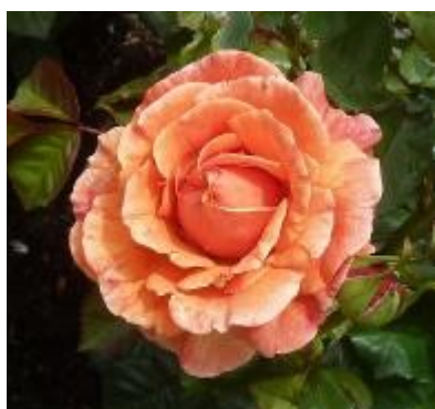
'Easy Does It' (2009, F) (HARpageant)