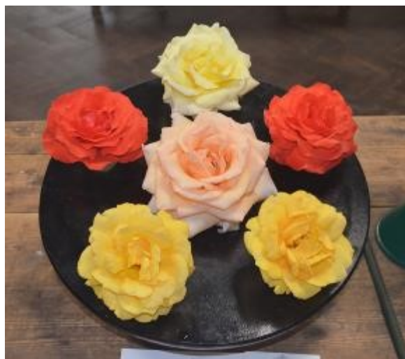
Left: Author judging at a rose show, Right: Artist pallet