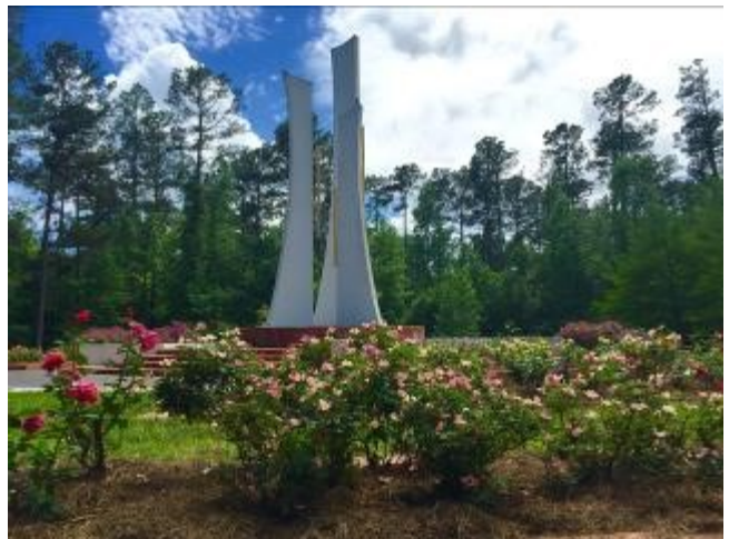
Left: Drone photo of new beds after construction, Right: ARS Rose Trials at Windsong Garden