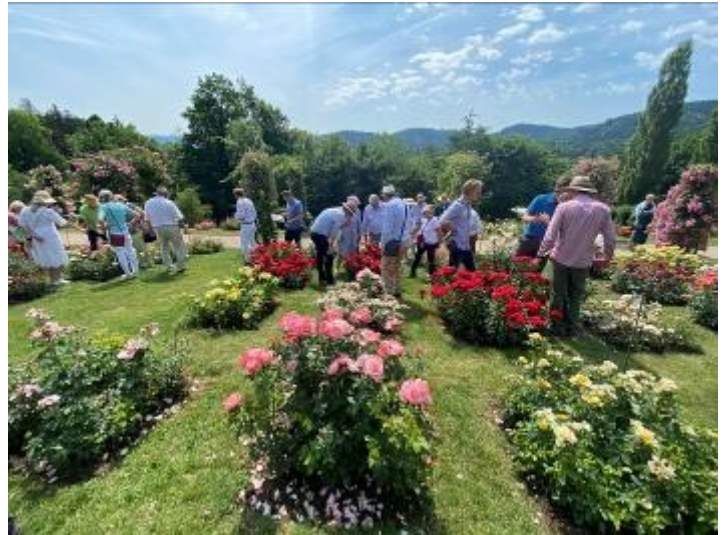
Above Left: Le Roeulx Rose Trials, Right: Nyon Rose Trials