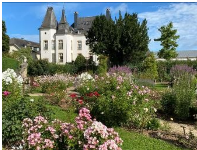
Left: 'Alisontia – Ville d'Esch Sur Alzette', Right: Roseraie Château de Munsbach