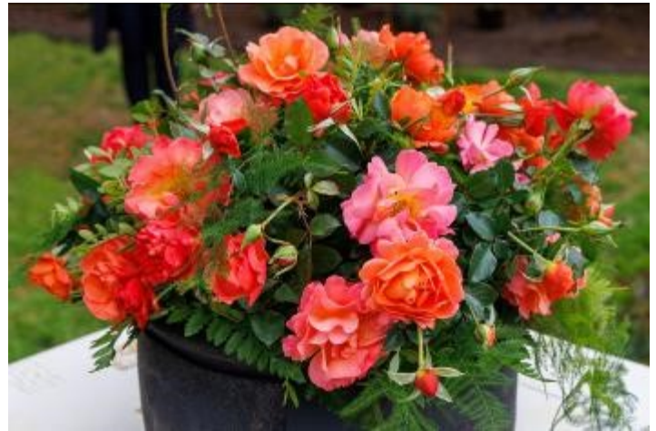
Christening of: Left: 'La Sauvage', Right: 'Cara Mia'