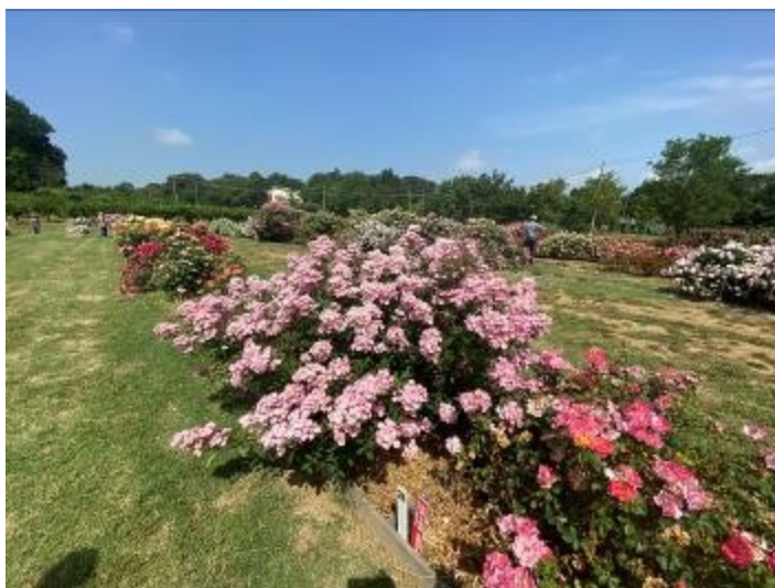
Left: Barcelona Rose Trials, Right: Bologna Rose Trials